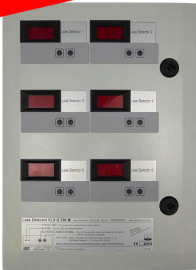
Vacuum leak detector VLX-S 350 M 6 displays/sensors (above) and with 1 display/sensor (below)