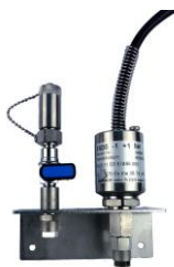
Installation kit for VLX-S 350 M

> The static operating leak detection system for the monitoring of double walled tanks with a suction line for the leak detector to the deepest point of the interstice.