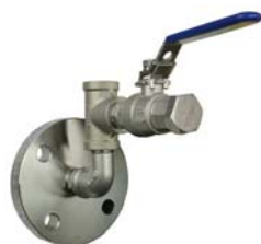
Installation kit measuring port