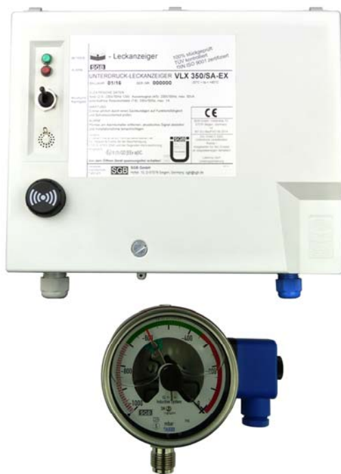
Leak detector VLX 350/SA-Ex consisting of leak indicating unit and leak detector

Partially explosion-proof to detect and indicate leaks in double-walled tanks and pipes.