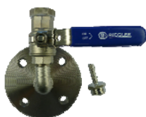
Installation kit test port